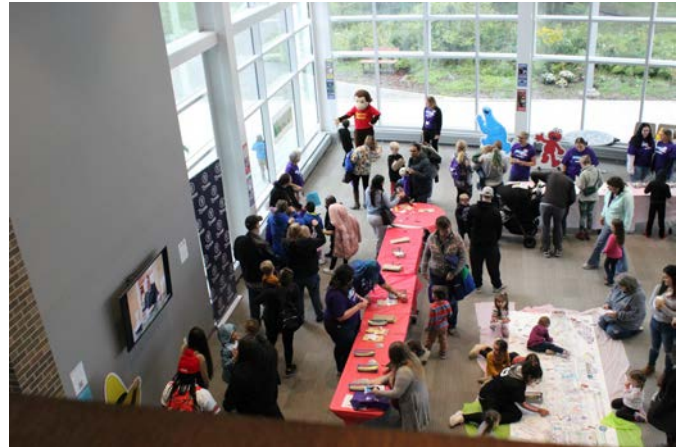
WQPT's 2023 Imagination Station featured 22 unique learning stations, with STEAM based activities.

Imagination Station, WQPT's children's educational event was held on Saturday, October 14, 2023. The event built on the learning successes of our PBS KIDS on-air programming and our in-person educational outreach in local classrooms. The event, supported by more than 100 community volunteers, welcomed 3,000 children & parents. Educational activities focused on literacy, science, technology, engineering, math & the arts. Special guests included 12 PBS KIDS characters with their unique learning stations featuring games, stories, make-and-take crafts & give-a-ways that reinforced learning concepts relevant to the PBS character's show.